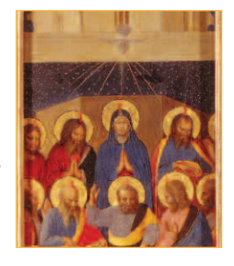
The Descent of the Holy Spirit There appeared to them tongues as of fire, distributed and resting on each one of them. Acts 2:3

So then the Lord Jesus, after he had spoken to them, was taken up into heaven, and sat down at the right hand of God. Mk 16:19