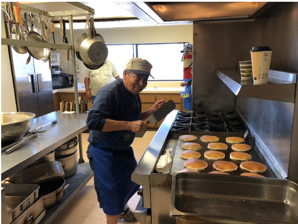
Your Pancake Breakfast Chef

The last Pancake Breakfast was held on May 6 th , and was our Annual Mother’s Day breakfast with the ladies being served free (except for carry outs). It was very successful and a good social event. Our next pancake breakfast is scheduled for June 3 rd .